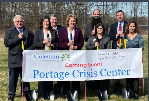
The Board held a ceremonial groundbreaking for the Portage Crisis Center expected to be completed in 2026 with services provided by Coleman Health Services. This project will offer expanded mental health crisis services for youth and families. Funding has been provided by the State of Ohio, Ohio Dept of Mental Health & Addiction Services, and local dollars. The new center will house crisis stabilization beds and 23-hour observation units for adults and children.